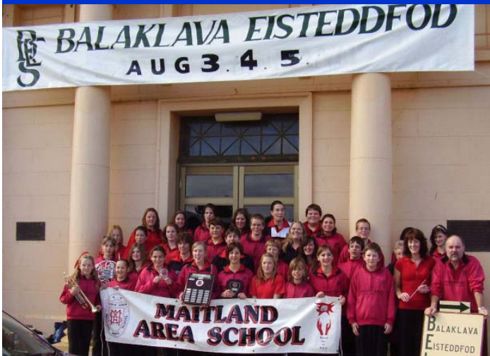
ABOVE: A very jubilant Maitland Area School, the Band Champions and 1st place winners for the 4th year running.